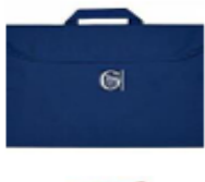
Waterproof Library Bag $15

School library bags are available for purchase from the uniform shop in our tuckshop. Alternatively, any bag that offers these features is able to be used as a library bag.