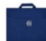
Library Bag $15ea