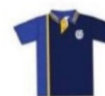
Polo Shirt $30ea

Uniforms are available at the Tuckshop. Wednesday to Friday 8am-2pm (during school term)